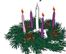
Third Sunday of Advent

The Third Sunday of Advent is known as Gaudete Sunday because of the first word "Rejoice" in the Introit or entrance antiphon of Sunday's Liturgy. "Rejoice" is also repeated throughout the readings and prayers. The vestments worn by the priest can be the color rose (sometimes referred to as pink). The third candle of the Advent wreath is also rose. Both are reminders that Christ's coming is very soon; we are nearing the end of Advent, and we can hardly contain our joy.