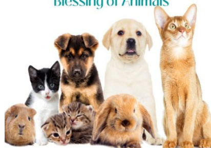
St. Mary's Parish, October 1, 5pm

The Annual Blessing of the Animals will take place in the Church parking lot after the 4pm Mass on Saturday, October 1.