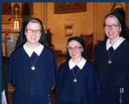
Parish Visitors of Mary Immaculate

Please pray for these young sisters and their vocations.