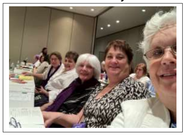
Delegates during Convention business meeting