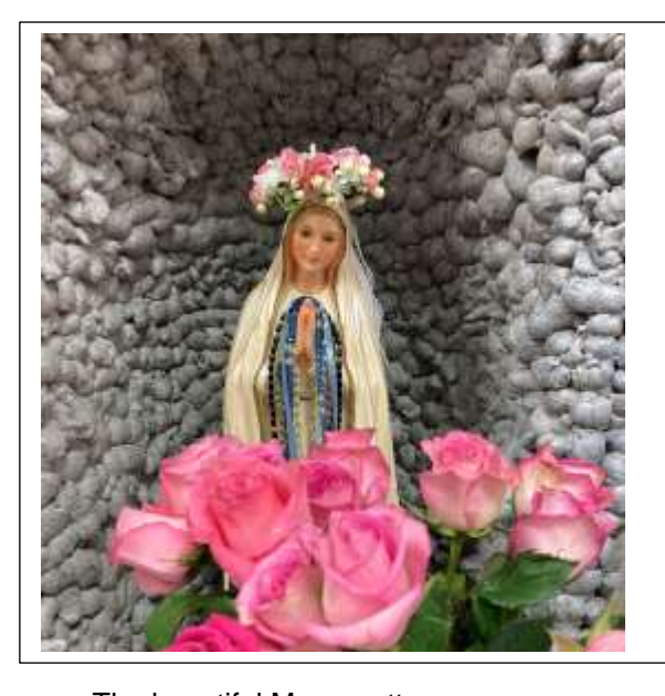
The beautiful Mary grotto