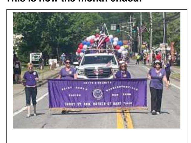
Memorial Day Parade