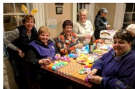
Filling Easter eggs at Betty's