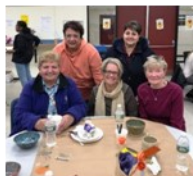
Empty bowls at WHS